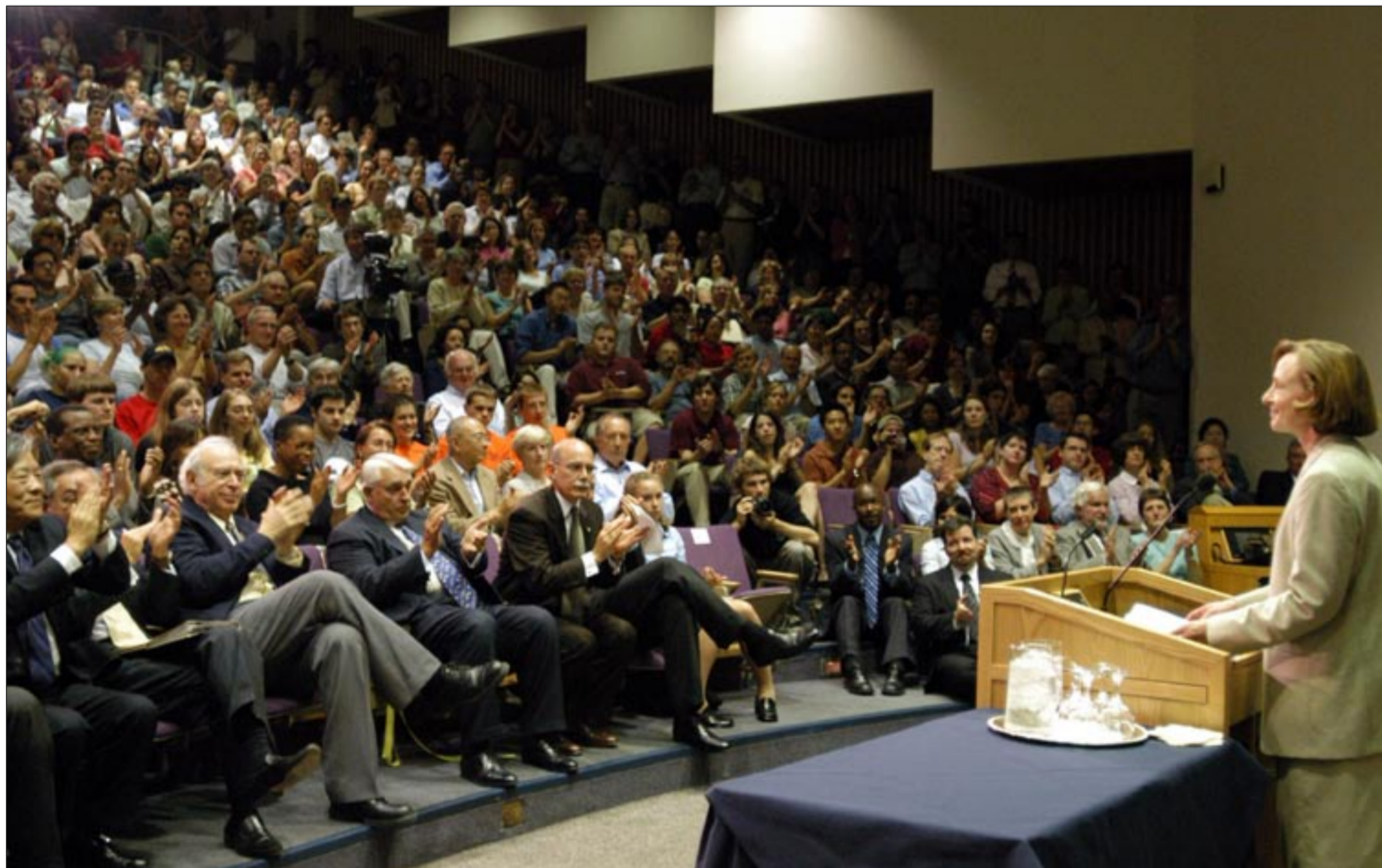
The MIT community applauds as President-elect Susan Hockfield takes the podium in Room 10-250 at the community meeting announcing her selection as MIT's 16th president.

Richard C. Levin President of Yale University